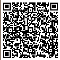
À La Carte

In order to view our menus, please scan the QR codes using the camera on your mobile device.