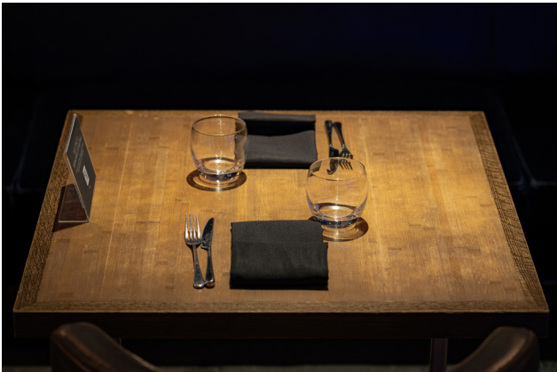
Scoff & Banter Lounge Bar Set-up