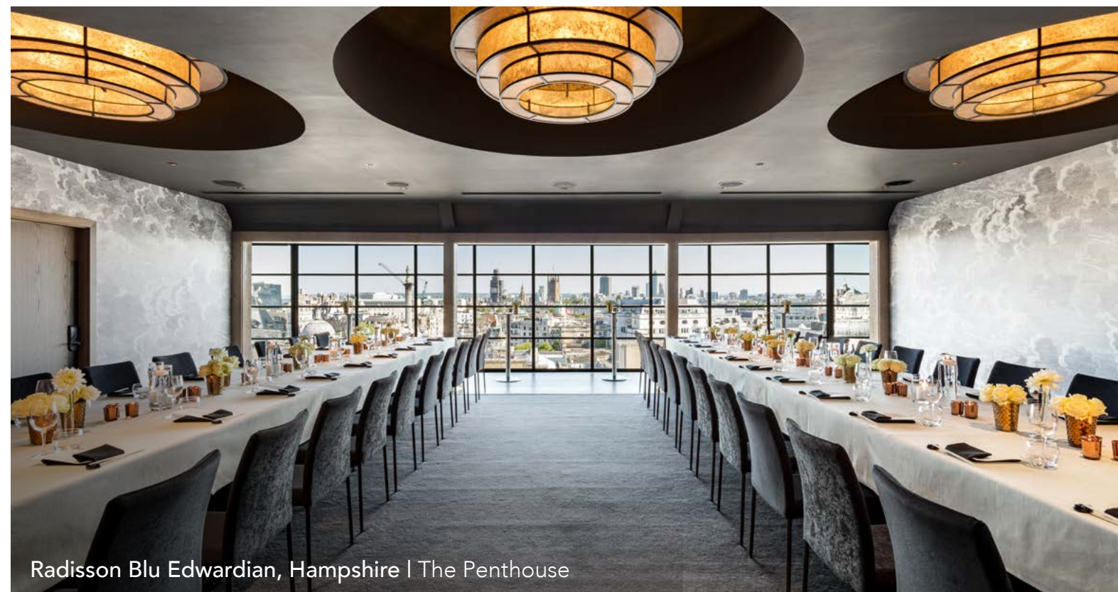
Radisson Blu Edwardian, Hampshire | The Penthouse