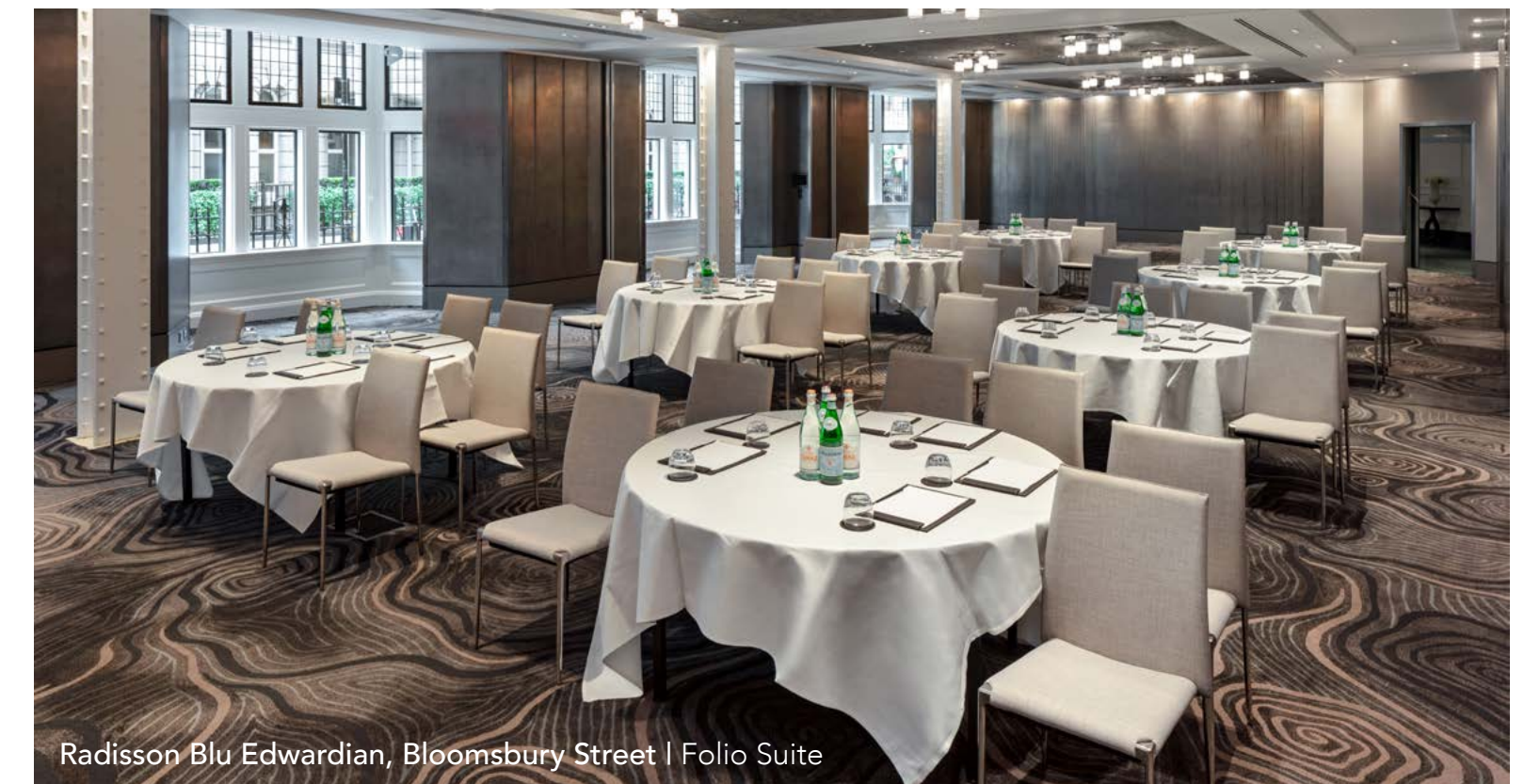
Radisson Blu Edwardian, Bloomsbury Street | Folio Suite

Get rewarded for your work when you book meetings and events with Edwardian Hotels London. With Radisson Rewards for Bookers and Planners, you can enjoy exclusive benefits including complimentary upgrades and points to spend on stays.